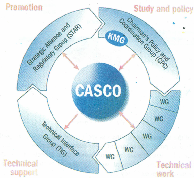
Fig. 4: CASCO Structure

CASCO has a structure that reflects it's various roles of policy development, writing of technical documents, promotion of those documents and monitoring market feedback on the use of those documents. A continual improvement cycle is in place to ensure that CASCO provides globally relevant documents that reflect modern conformity assessment practice.