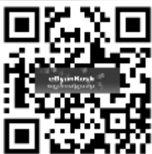
QR Code -e Gyankosh-site