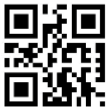
QR Code -website ignou.ac.in