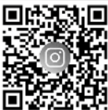
INSTAGRAM (Official Page IGNOU)