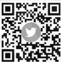
QR Code Twitter Handel (OfficialIGNOU)