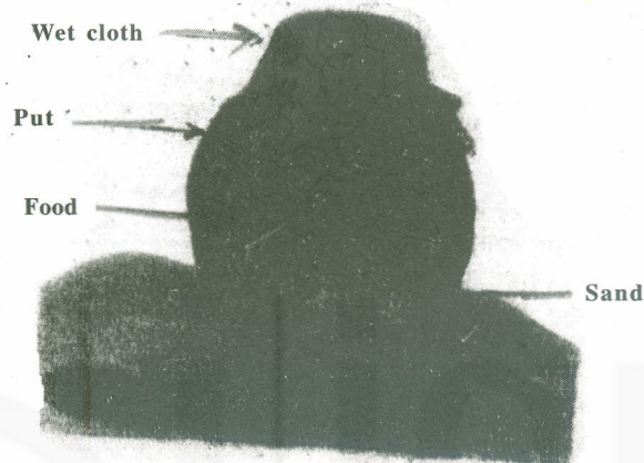
Figure 17.1: Janata Refrigerator